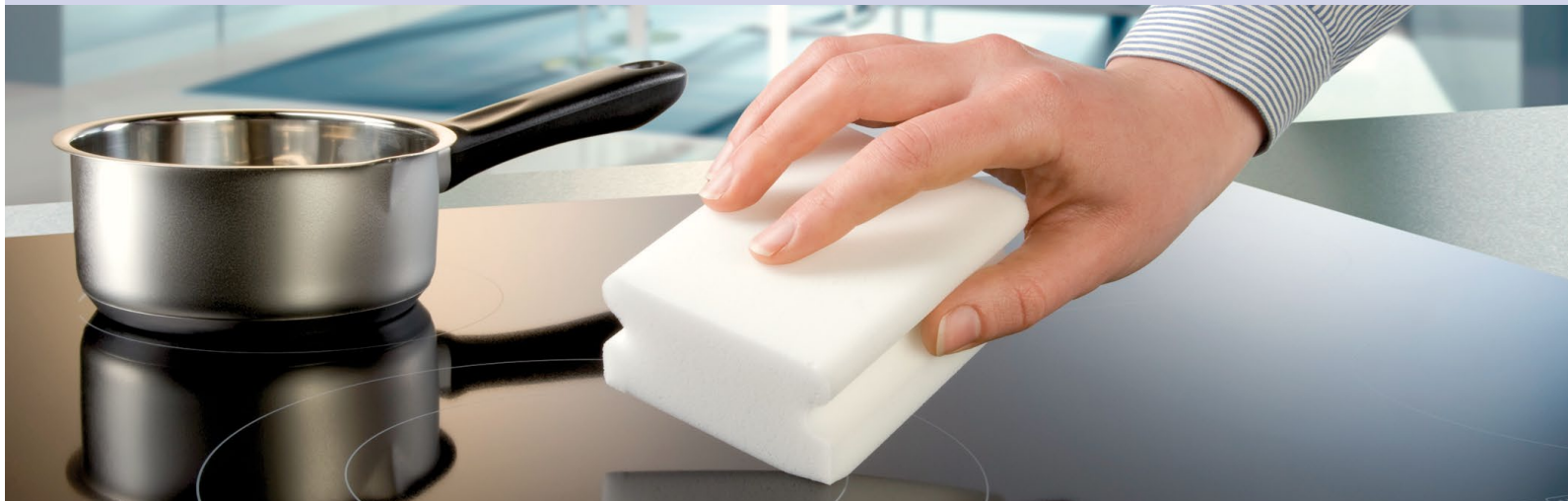
Basotect® W, the optimal grade for cleaning applications