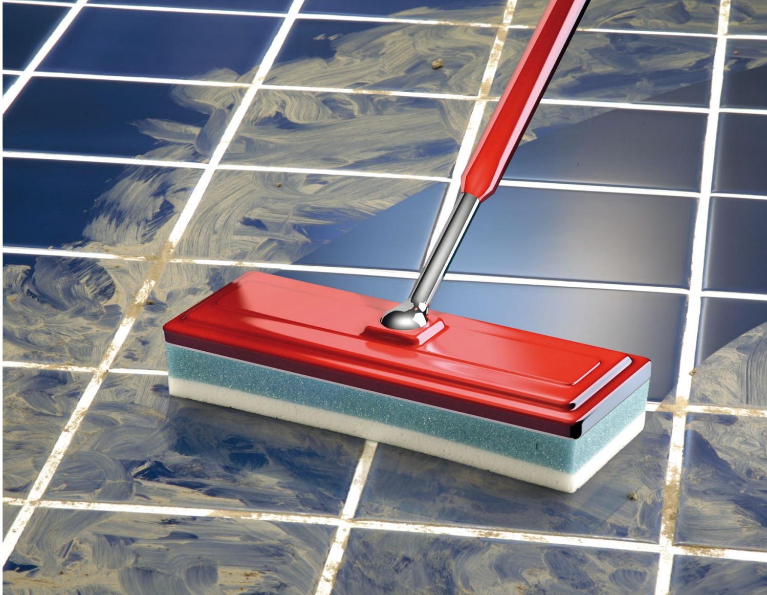
Effective cleaning power on dirty floors

Basotect® W meets the currently applicable human-ecological requirements of the Oeko-Tex® Standard 100 in product class I for textile products with direct skin contact in especially sensitive applications.